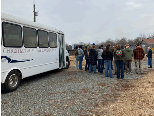
Arrival & orientation to the farm.

High school students from United Christian Academy (Green County, Virginia) visited Cattle Run Farms to explore real-world agriculture. They toured facilities housing goats, pigs, rabbits, cattle, and chickens, learned about breeding practices and why farmers avoid winter births, and saw how milk is managed for goat kids and mothers. The group also learned about sustainable farming methods like mortality composting, chicken grazing, and beekeeping, gaining hands-on insight into animal health and farm operations.