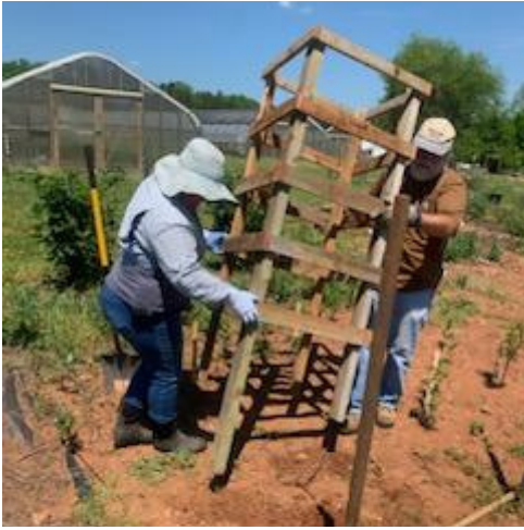
Installing a donated trellis.