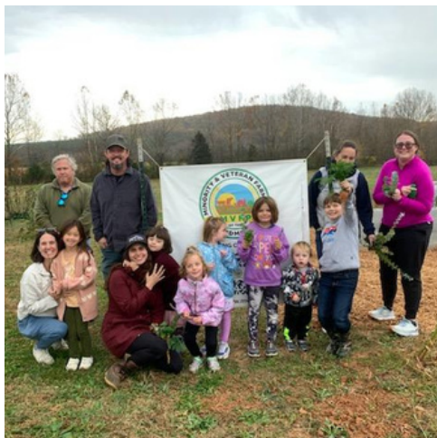
Youth volunteers at the Carver Center.