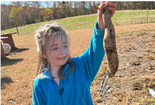
A sweet potato harvested!