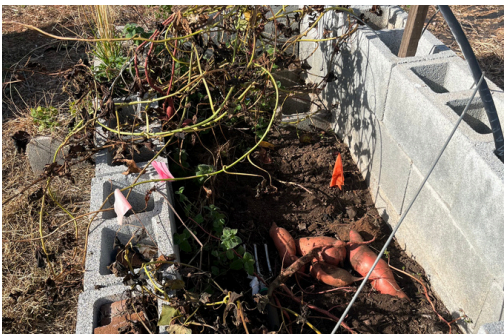
Uncovered sweet potato harvest.