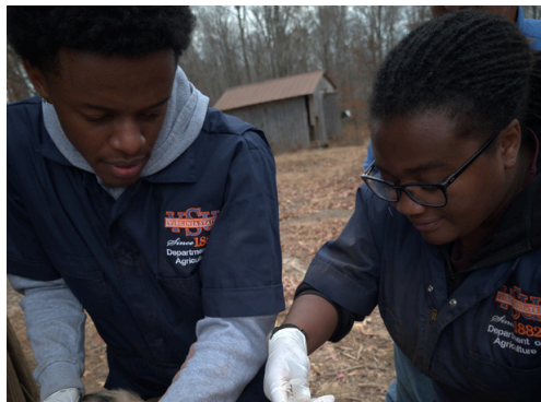
Above & at left: Students learn how to sterilize piglets.