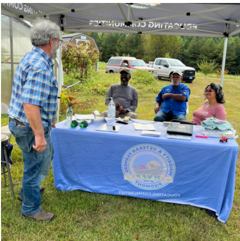
MVFP volunteers table at a community day.