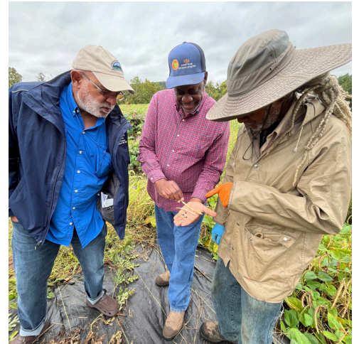
Checking out the crops.