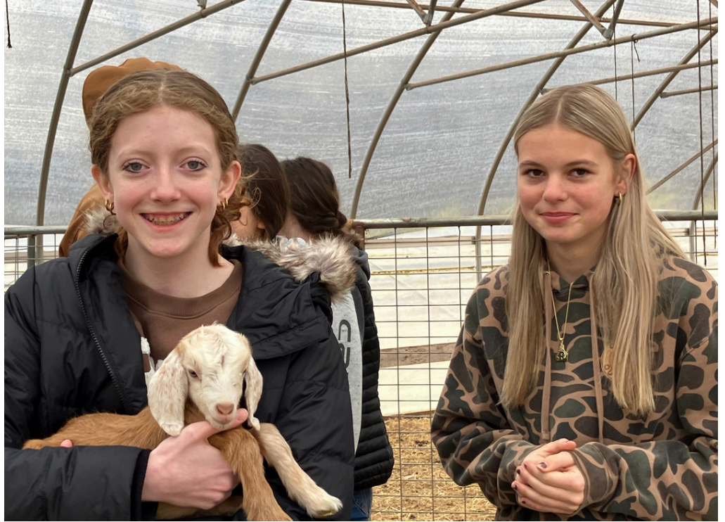
Students had the opportunity to hold weeks-old goat kids.