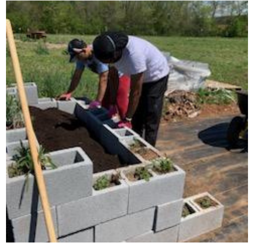
Building raised beds as a part of veteran outreach.