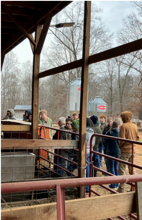
Learning about quarantining animals at the pig barn.