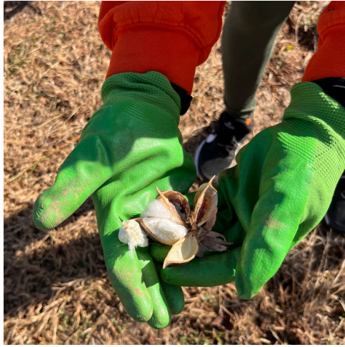
An example of the cotton harvested at the Carver Center.