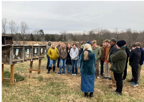
Exploring rabbit care for meat.