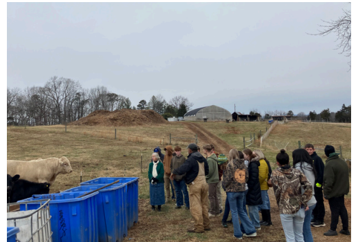
Bulls eat sustainably sourced grain.