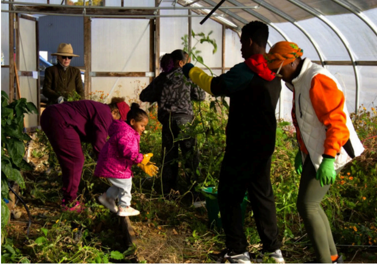
Maintaining the greenhouse, aka "hoop house" or high tunnel.