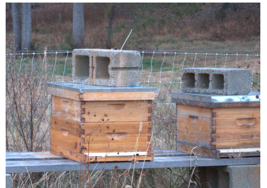
Bee boxes at Cattle Run Farm