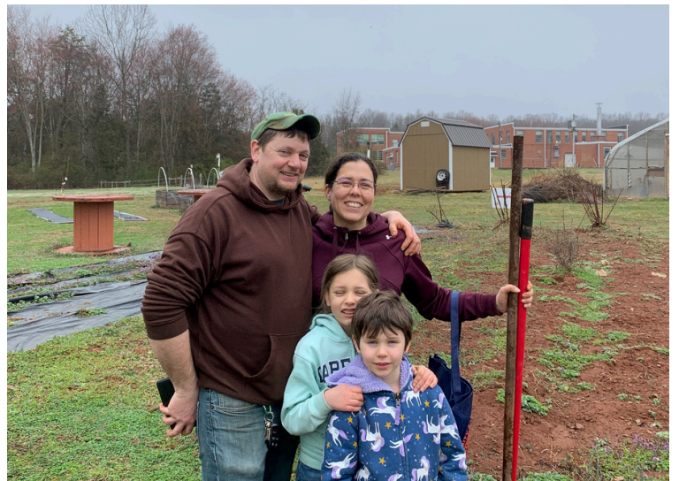
Family fun and learning is made possible by MVFP.