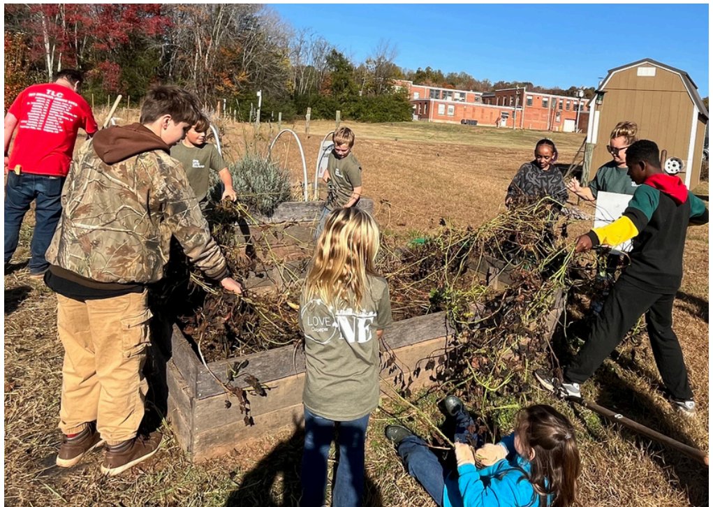
Volunteers work to unearth sweet potatoes from the raised beds.