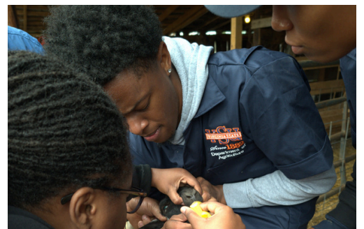
Two photos above: Learning to care for & immunize goats.