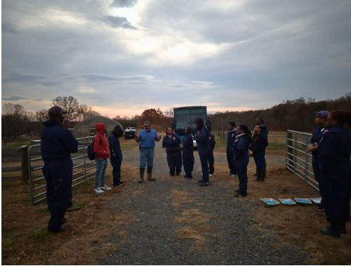
An early start with a walking tour.

Cattle Run Farm, LLC gave VSU College of Agriculture students a hands-on “day in the life of a producer” experience in November 2025.