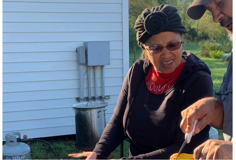
A poultry processing demonstration.