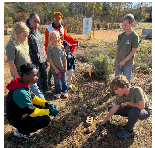
Young volunteers sharing knowledge at the Carver Center.