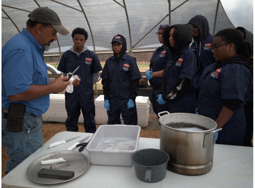
Students harvested chickens and learned how to cut the meat into sections that one might see at the grocery store.