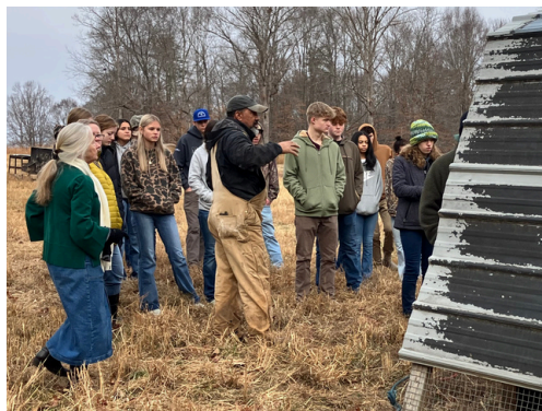
"Chicken tractors" help make chicken grazing a more controlled operation.