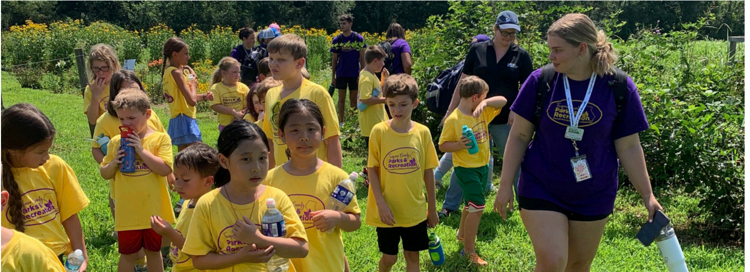
Youth from Culpeper County Parks and Recreation joined MVFP for a day of learning.