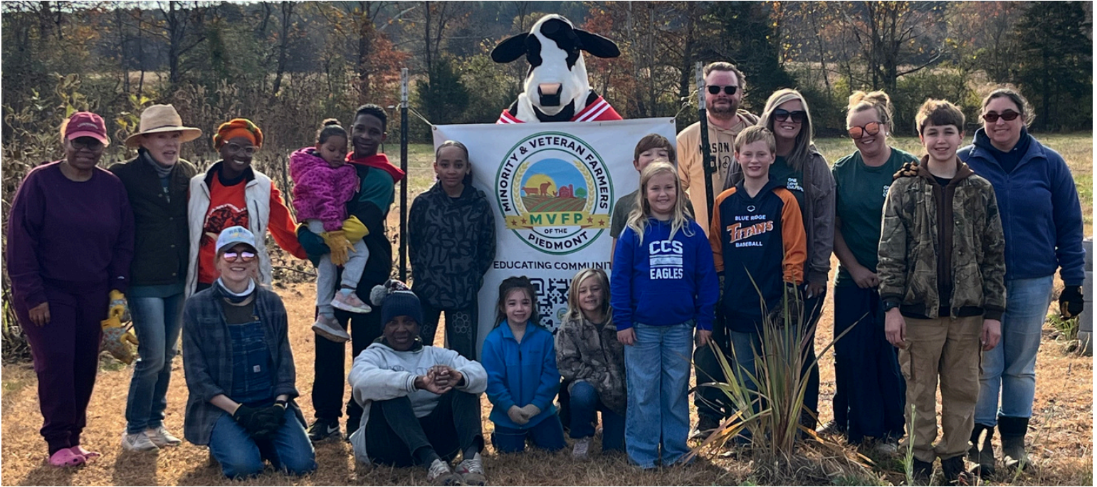
Youth Harvest volunteers pose for a photo.

In November, MVFP hosted a Youth Harvest event at the Carver Center in Culpeper , engaging nine local children in hands-on agricultural activities. (Photos below.) Participants harvested over 35 pounds of sweet potatoes – 25 pounds donated to the Carver Food Enterprise – and learned to care for herb gardens, blackberry bushes, and soil preparation. This initiative reflects MVFP's commitment to youth agricultural education, community service, and food security.