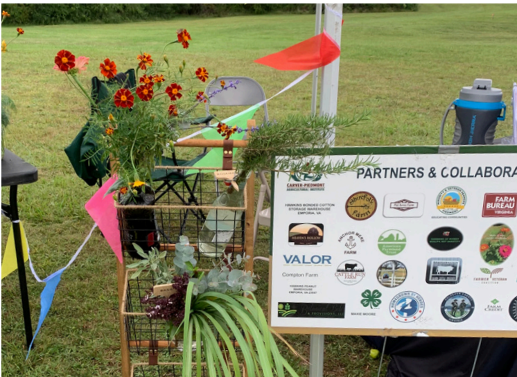
Community Day display.