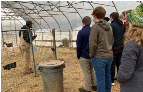
Learning about raising goats & kids.