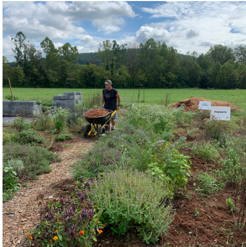
Plants & beds are maintained.