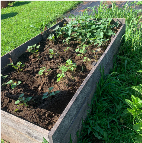
Another type of raised bed plantings at the Carver